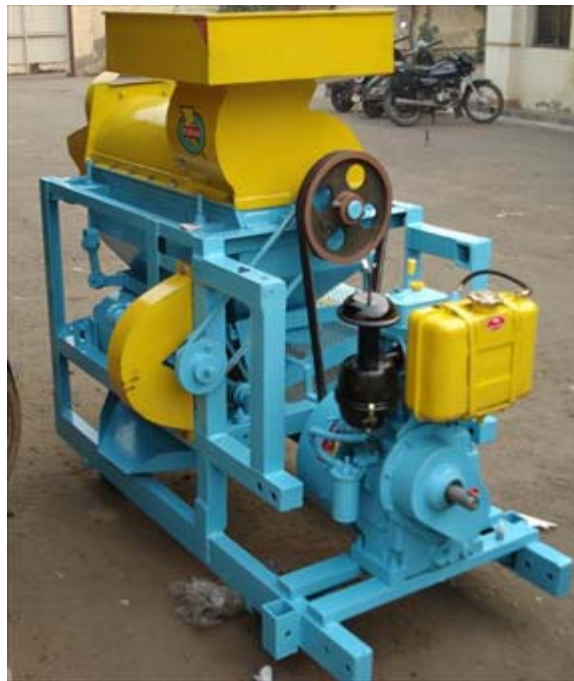
MODEL – B-2A