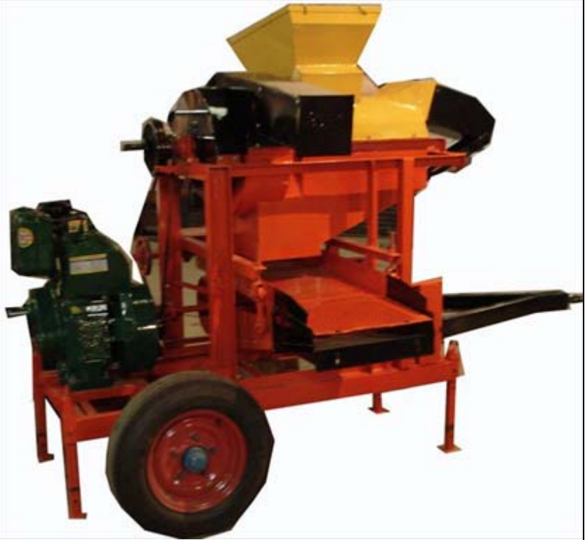
MODEL – B-3A