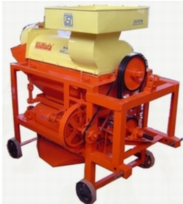
MODEL – B-2