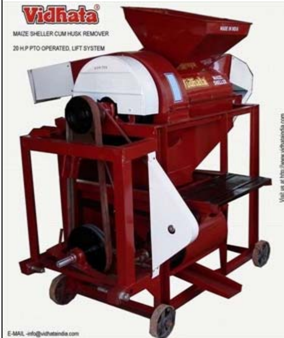
MODEL – B-3