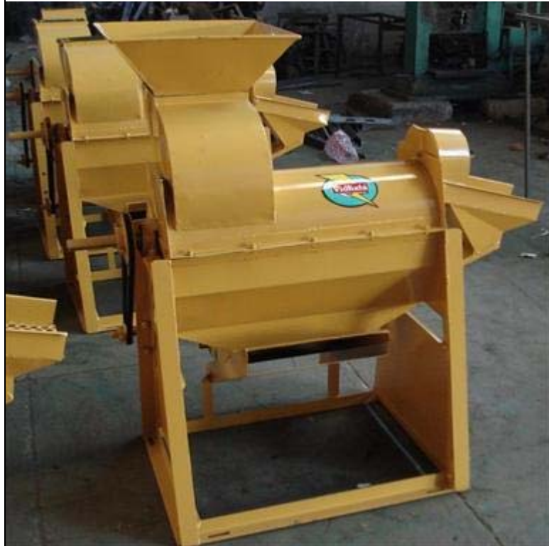
MODEL – B-1 / VIDHATA