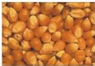
Clean Maize seed