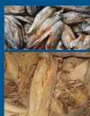
Maize Cob with outer cover and husk