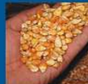
Clean Maize seed

Any tractor 20-60 hp can work with machine