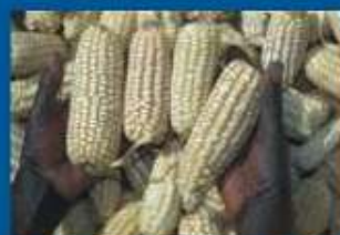
Maize Cob with out outer cover and husk