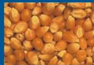
Clean Maize seed

Any tractor 15-60 hp can work with machine