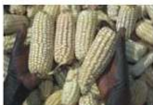
Maize Cob with out outer cover and husk