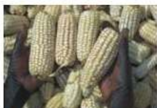
Maize Cob with out outer cover and husk