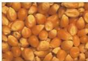
Clean Maize seed