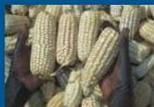
Maize Cob with out outer cover and husk