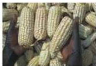
Maize Cob with out outer cover and husk